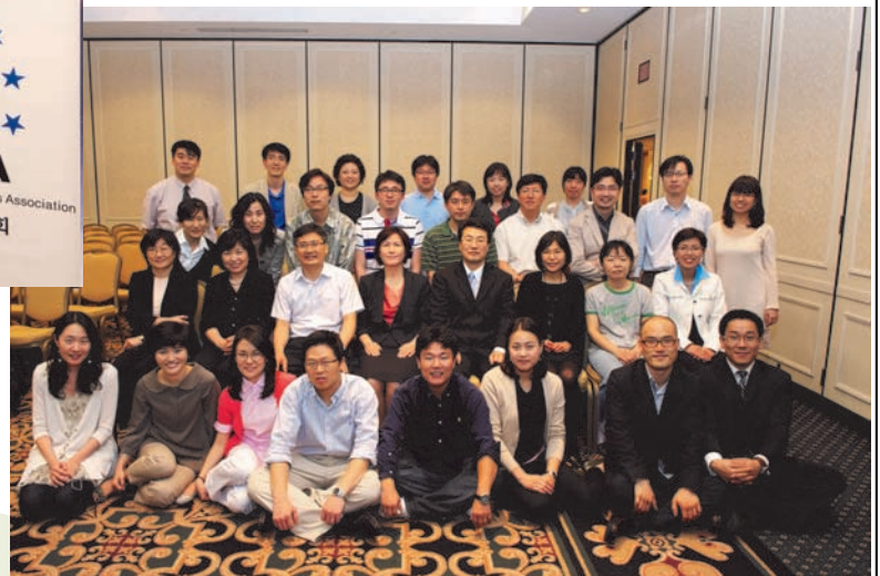
KAERA members gathered to take a picture prior to commencing the annual conference